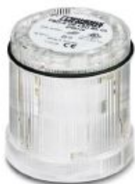
LED blinking light element, 24 V AC/DC, clear

Please be informed that the data shown in this PDF Document is generated from our Online Catalog. Please find the complete data in the user's documentation. Our General Terms of Use for Downloads are valid ( http://phoenixcontact.com/download )