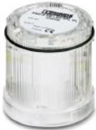
LED random flashing beacon element, 24 V DC, clear

Please be informed that the data shown in this PDF Document is generated from our Online Catalog. Please find the complete data in the user's documentation. Our General Terms of Use for Downloads are valid ( http://phoenixcontact.com/download )