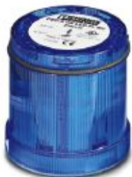
LED flashing beacon element, 24 V DC, double lightning, blue

Please be informed that the data shown in this PDF Document is generated from our Online Catalog. Please find the complete data in the user's documentation. Our General Terms of Use for Downloads are valid ( http://phoenixcontact.com/download )