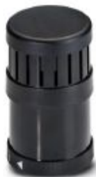
Siren element, pulse tone, 24 V DC, self-regulating volume, max. 100 dB(A), black

Please be informed that the data shown in this PDF Document is generated from our Online Catalog. Please find the complete data in the user's documentation. Our General Terms of Use for Downloads are valid ( http://phoenixcontact.com/download )