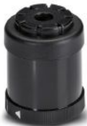
Siren element, alternating, 24 V DC, max. 105 dB(A), black

Please be informed that the data shown in this PDF Document is generated from our Online Catalog. Please find the complete data in the user's documentation. Our General Terms of Use for Downloads are valid ( http://phoenixcontact.com/download )