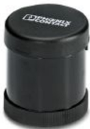
Siren element, 7 tones, 24 V DC, max. 100 dB(A), tone range over 3 signal lines, black

Please be informed that the data shown in this PDF Document is generated from our Online Catalog. Please find the complete data in the user's documentation. Our General Terms of Use for Downloads are valid ( http://phoenixcontact.com/download )