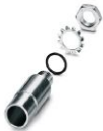
Adapter for single-hole mounting

Please be informed that the data shown in this PDF Document is generated from our Online Catalog. Please find the complete data in the user's documentation. Our General Terms of Use for Downloads are valid ( http://phoenixcontact.com/download )