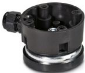
Outlet box with magnetic base for base mounting, black

Please be informed that the data shown in this PDF Document is generated from our Online Catalog. Please find the complete data in the user's documentation. Our General Terms of Use for Downloads are valid ( http://phoenixcontact.com/download )