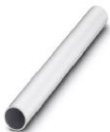
Tube, 400 mm high, Ø 25 mm

Please be informed that the data shown in this PDF Document is generated from our Online Catalog. Please find the complete data in the user's documentation. Our General Terms of Use for Downloads are valid ( http://phoenixcontact.com/download )