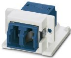
Coupling, LC/LC, can be used for single mode glass fibers

Please be informed that the data shown in this PDF Document is generated from our Online Catalog. Please find the complete data in the user's documentation. Our General Terms of Use for Downloads are valid ( http://phoenixcontact.com/download )