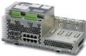
Gigabit Modular Switch with integrated routing function

Ethernet Gigabit Modular Switch with four 1000 Mbps combo ports and twelve 10/100 Mbps RJ45 slots, can be extended by an extension station to up to 24 ports, with integrated routing function