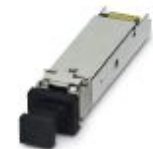
Gigabit SFP module for transmission up to 30 km with a wavelength of 1310 nm.