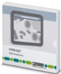
License for updating WebVisit 5 Pro to WebVisit 6 Pro

Please be informed that the data shown in this PDF Document is generated from our Online Catalog. Please find the complete data in the user's documentation. Our General Terms of Use for Downloads are valid ( http://phoenixcontact.com/download )