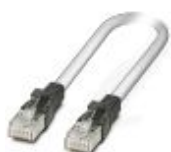
Patch cable, CAT5, assembled, 5 m

Patch cable - FL CAT5 PATCH 5,0 - 2832580