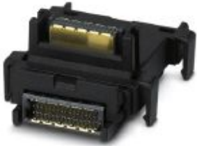
Axioline F bus base module for housing type H

Please be informed that the data shown in this PDF Document is generated from our Online Catalog. Please find the complete data in the user's documentation. Our General Terms of Use for Downloads are valid ( http://phoenixcontact.com/download )