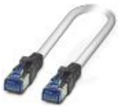
Patch cable, CAT6, pre-assembled, 2.0 m

Patch cable - FL CAT6 PATCH 2,0 - 2891589