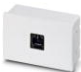
Panel to mount in base unit, RJ-45 connector for remote Operator Panel

Mounting unit - NLC-OP1-MKT-BASE - 2701250