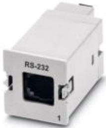
RS-232 connection for data transfer or software configuration

Please be informed that the data shown in this PDF Document is generated from our Online Catalog. Please find the complete data in the user's documentation. Our General Terms of Use for Downloads are valid ( http://phoenixcontact.com/download )