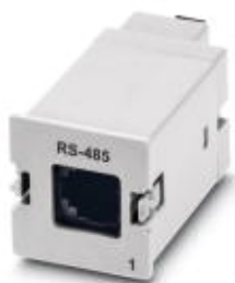
RS-485 connection for data transfer or software configuration

Please be informed that the data shown in this PDF Document is generated from our Online Catalog. Please find the complete data in the user's documentation. Our General Terms of Use for Downloads are valid ( http://phoenixcontact.com/download )