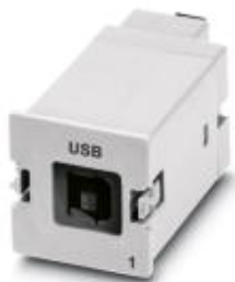
Serial connection to PC's USB port for data transfer or software configuration

Please be informed that the data shown in this PDF Document is generated from our Online Catalog. Please find the complete data in the user's documentation. Our General Terms of Use for Downloads are valid ( http://phoenixcontact.com/download )