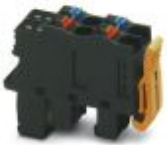
Axioline F short power connector (for e.g., AXL F BK ...)

Phoenix Contact 2020 © - all rights reserved http://www.phoenixcontact.com