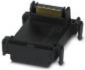
Axioline F bus base module for housing type BK