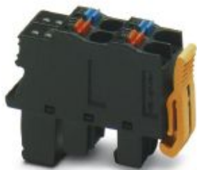
Axioline F short power connector (for e.g., AXL F BK ...)

Please be informed that the data shown in this PDF Document is generated from our Online Catalog. Please find the complete data in the user's documentation. Our General Terms of Use for Downloads are valid ( http://phoenixcontact.com/download )