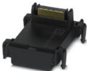
Axioline F bus base module for housing type BK

Please be informed that the data shown in this PDF Document is generated from our Online Catalog. Please find the complete data in the user's documentation. Our General Terms of Use for Downloads are valid ( http://phoenixcontact.com/download )