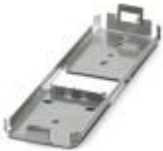
Mounting plate for Axioline E metal devices