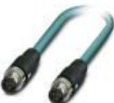
Network cable, Ethernet CAT5 (100 Mbps), 4-position, shielded, Plug straight M12 SPEEDCON / IP67, coding: D, on Plug straight M12 SPEEDCON / IP67, coding: D, cable length: Free input (0.2 ... 40.0 m)

Network cable - NBC-MSD-MSD SCO/.../... - 1408706