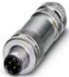
Data connector, Ethernet/PROFINET CAT5 (100 Mbps), 4-position, shielded, Plug straight M12, Coding: D, Screw connection, knurl material: Zinc die-cast, nickel-plated, cable gland Pg9, external cable diameter 6 mm ... 8 mm

Data connector - SACC-M12MSD-4CON-PG 9-SH - 1521261