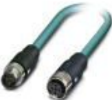
Network cable, Ethernet CAT5 (100 Mbps), 4-position, shielded, Plug straight M12 SPEEDCON / IP67, coding: D, on Socket straight M12 SPEEDCON / IP67, coding: D, cable length: Free input (0.2 ... 40.0 m)

Network cable - NBC-MSD-FSD SCO/.../... - 1408692