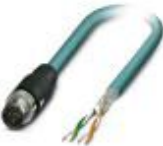
Network cable, Ethernet CAT5 (100 Mbps), 4-position, shielded, Plug straight M12 SPEEDCON / IP67, coding: D, on free cable end, cable length: Free input (0.2 ... 40.0 m)

Network cable - NBC-MSD SCO/.../... - 1408713