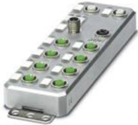
Axioline E, Digital input device, EtherNet/IP™, M12 fast connection technology, Digital inputs: 16, 24 V DC, connection method: 4-wire, Metal housing, degree of protection: IP65/IP67

Please be informed that the data shown in this PDF Document is generated from our Online Catalog. Please find the complete data in the user's documentation. Our General Terms of Use for Downloads are valid ( http://phoenixcontact.com/download )