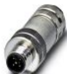
Data connector, PROFIBUS, INTERBUS, 5-position, shielded, Plug straight M12, Coding: B, Screw connection, knurl material: Zinc die-cast, nickel-plated, cable gland Pg9, external cable diameter 6.5 mm ... 8.5 mm

Data connector - SACC-M12MSB-5CON-PG9 SH AU - 1507764