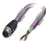
Bus system cable, PROFIBUS (12 Mbps), 2-position, PUR halogen-free, violet RAL 4001, shielded, Plug straight M12 SPEEDCON, coding: B, on free cable end, cable length: Free input (0.2 ... 40.0 m)

Bus system cable - SAC-2P-MSB SCO/910/... - 1538050