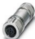
Connector, Universal, 5-position, shielded, Socket straight M12, Coding: B, Push-in connection, knurl material: Zinc die-cast, nickel-plated, external cable diameter 4 mm ... 8 mm

Connector - SACC-M12FSB-5PL SH - 1424664