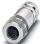
Data connector, PROFIBUS, INTERBUS, 5-position, shielded, Socket straight M12, Coding: B, Screw connection, knurl material: Zinc die-cast, nickel-plated, cable gland Pg9, external cable diameter 6.5 mm ... 8.5 mm

Data connector - SACC-M12FSB-5CON-PG9 SH AU - 1507777