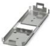
Mounting plate for Axioline E metal devices