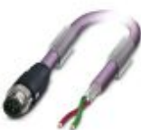
Bus system cable, PROFIBUS (12 Mbps), 2-position, PUR halogen-free, violet RAL 4001, shielded, Plug straight M12 SPEEDCON, coding: B, on free cable end, cable length: Free input (0.2 ... 40.0 m)

Bus system cable - SAC-2P-MSB SCO/910/... - 1538050