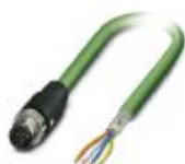
Network cable, PROFINET CAT5 (100 Mbps), EtherCAT® CAT5 (100 Mbps), 4-position, Variable cable type, shielded, Plug straight M12 SPEEDCON / IP67, coding: D, on free cable end, cable length: Free input (0.2 ... 40.0 m)

Network cable - NBC-MSD SCO-PN/.../... - 1408640