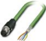
Network cable, PROFINET CAT5 (100 Mbps), EtherCAT® CAT5 (100 Mbps), 4-position, Variable cable type, shielded, Plug straight M12 SPEEDCON / IP67, coding: D, on free cable end, cable length: Free input (0.2 ... 40.0 m)

Network cable - NBC-MSD SCO-PN/.../... - 1408640