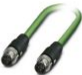
Network cable, PROFINET CAT5 (100 Mbps), EtherCAT® CAT5 (100 Mbps), 4-position, Variable cable type, shielded, Plug straight M12 SPEEDCON / IP67, coding: D, on Plug straight M12 SPEEDCON / IP67, coding: D, cable length: Free input (0.2 ... 40.0 m)

Network cable - NBC-MSD-MSD SCO-PN/.../... - 1408634