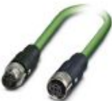
Network cable, PROFINET CAT5 (100 Mbps), EtherCAT® CAT5 (100 Mbps), 4-position, Variable cable type, shielded, Plug straight M12 SPEEDCON / IP67, coding: D, on Socket straight M12 SPEEDCON / IP67, coding: D, cable length: Free input (0.2 ... 40.0 m)

Network cable - NBC-MSD-FSD SCO-PN/.../... - 1408617