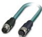
Network cable, Ethernet CAT5 (100 Mbps), 4-position, shielded, Plug straight M12 SPEEDCON / IP67, coding: D, on Socket straight M12 SPEEDCON / IP67, coding: D, cable length: Free input (0.2 ... 40.0 m)

Network cable - NBC-MSD-FSD SCO/.../... - 1408692