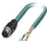
Network cable, Ethernet CAT5 (100 Mbps), 4-position, shielded, Plug straight M12 SPEEDCON / IP67, coding: D, on free cable end, cable length: Free input (0.2 ... 40.0 m)

Network cable - NBC-MSD SCO/.../... - 1408713