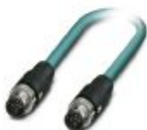
Network cable, Ethernet CAT5 (100 Mbps), 4-position, shielded, Plug straight M12 SPEEDCON / IP67, coding: D, on Plug straight M12 SPEEDCON / IP67, coding: D, cable length: Free input (0.2 ... 40.0 m)

Network cable - NBC-MSD-MSD SCO/.../... - 1408706