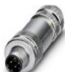
Data connector, Ethernet/PROFINET CAT5 (100 Mbps), 4-position, shielded, Plug straight M12, Coding: D, Screw connection, knurl material: Zinc die-cast, nickel-plated, cable gland Pg9, external cable diameter 6 mm ... 8 mm

Data connector - SACC-M12MSD-4CON-PG 9-SH - 1521261