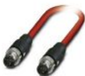
Bus system cable, Sercos CAT5 (100 Mbps), 4-position, PVC, Red RAL 3020, Plug straight M12 / IP67, coding: D, on Plug straight M12 / IP67, coding: D, cable length: 2 m

Bus system cable - VS-MSDS-MSDS-93K-LI/2,0 - 1419169