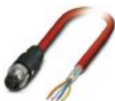
Bus system cable, Sercos CAT5 (100 Mbps), 4-position, PVC, Red RAL 3020, Plug straight M12 / IP67, coding: D, on free cable end, cable length: 2 m

Bus system cable - VS-MSDS-OE-93K-LI/2,0 - 1419172