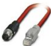
Bus system cable, Sercos CAT5 (100 Mbps), 4-position, PVC, Red RAL 3020, Plug straight M12 SPEEDCON / IP67, coding: D, on Plug straight RJ45 / IP20, cable length: 2 m

Bus system cable - VS-MSDS-IP20-93K-LI/2,0 - 1419168