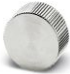
Metal protection cap for connectors with M17 external thread

Metal protective cap - ST-Z0014 - 1616069