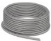
INTERBUS hybrid cable for the extended installation remote bus

Hybrid cable - IBS EINBC METER - 2752107