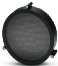
LED signal lamp, 24 V DC, red, communication

Please be informed that the data shown in this PDF Document is generated from our Online Catalog. Please find the complete data in the user's documentation. Our General Terms of Use for Downloads are valid ( http://phoenixcontact.com/download )