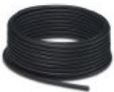
By the meter, Installation remote bus cable, INTERBUS, shielded, PVC/PVC, black RAL 9005, 9-wire (3 x 2 x 0.22 mm 2 + 3 x 1 mm 2 ), color single wire: green-yellow, white-brown, gray-pink, red, blue, green/yellow, for underground runs

Installation remote bus cable - IBS INBC METER/E - 2723152