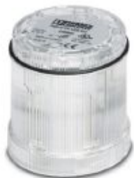
LED permanent light element, 24 V DC, 7 colors

Please be informed that the data shown in this PDF Document is generated from our Online Catalog. Please find the complete data in the user's documentation. Our General Terms of Use for Downloads are valid ( http://phoenixcontact.com/download )