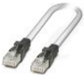
Patch cable, CAT5, assembled, 5 m

Patch cable - FL CAT5 PATCH 5,0 - 2832580