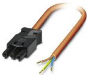
Power cable, 3-position, PVC, orange RAL 2004, free cable end, on Socket straight, coding: black, cable length: 3 m

Please be informed that the data shown in this PDF Document is generated from our Online Catalog. Please find the complete data in the user's documentation. Our General Terms of Use for Downloads are valid ( http://phoenixcontact.com/download )