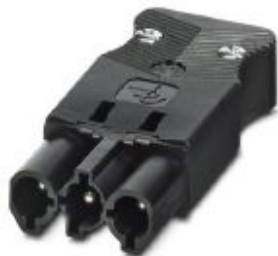
Connector for series connection, black, 3-pos.

Please be informed that the data shown in this PDF Document is generated from our Online Catalog. Please find the complete data in the user's documentation. Our General Terms of Use for Downloads are valid ( http://phoenixcontact.com/download )