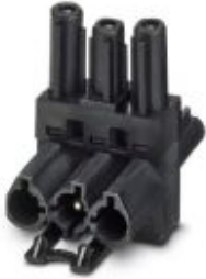
T-distributor with 2 sockets and one connector for series connection, black, 3-pos.

Please be informed that the data shown in this PDF Document is generated from our Online Catalog. Please find the complete data in the user's documentation. Our General Terms of Use for Downloads are valid ( http://phoenixcontact.com/download )