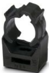
Mounting clamp for fastening the FL LCX CABLE METER leaky wave conductor.

Please be informed that the data shown in this PDF Document is generated from our Online Catalog. Please find the complete data in the user's documentation. Our General Terms of Use for Downloads are valid ( http://phoenixcontact.com/download )