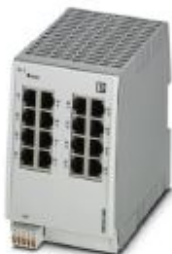
Managed Switch 2000, 16 RJ45 ports 10/100/1000 Mbps, degree of protection: IP20, PROFINET Conformance-Class A

Please be informed that the data shown in this PDF Document is generated from our Online Catalog. Please find the complete data in the user's documentation. Our General Terms of Use for Downloads are valid ( http://phoenixcontact.com/download )