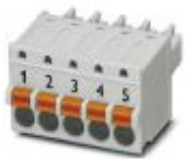
PCB connector, nominal current: 8 A, rated voltage (III/2): 160 V, nominal cross section: 1.5 mm 2 , number of positions: 5, pitch: 3.81 mm, connection method: Push-in spring connection, color: light gray, contact surface: Tin

Printed-circuit board connector - FK-MCP 1,5/ 5-ST-3,81GY35BD1-5 - 1015782