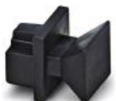
Dust protection caps for RJ45 socket

Dust protection - FL RJ45 PROTECT CAP - 2832991