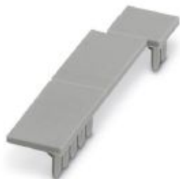
Terminal cover, 1 strip covers up to 12 terminal points, for ME-BUS terminal opening, (male side)

Please be informed that the data shown in this PDF Document is generated from our Online Catalog. Please find the complete data in the user's documentation. Our General Terms of Use for Downloads are valid ( http://phoenixcontact.com/download )