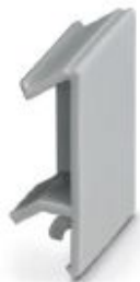
DIN rail housing, Filler plug for unoccupied terminal points, width: 15 mm, height: 21.6 mm, color: light gray (7035)

Please be informed that the data shown in this PDF Document is generated from our Online Catalog. Please find the complete data in the user's documentation. Our General Terms of Use for Downloads are valid ( http://phoenixcontact.com/download )