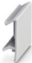
DIN rail housing, Filler plug for unoccupied terminal points, width: 20 mm, height: 21.6 mm, color: light gray (7035)

Please be informed that the data shown in this PDF Document is generated from our Online Catalog. Please find the complete data in the user's documentation. Our General Terms of Use for Downloads are valid ( http://phoenixcontact.com/download )