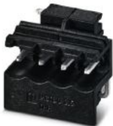
PCB headers, pin layout: Linear pinning, Article with lateral pin exit

Please be informed that the data shown in this PDF Document is generated from our Online Catalog. Please find the complete data in the user's documentation. Our General Terms of Use for Downloads are valid ( http://phoenixcontact.com/download )