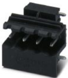
PCB headers, pitch: 5 mm, pin layout: Linear pinning, Article with lateral pin exit

Please be informed that the data shown in this PDF Document is generated from our Online Catalog. Please find the complete data in the user's documentation. Our General Terms of Use for Downloads are valid ( http://phoenixcontact.com/download )