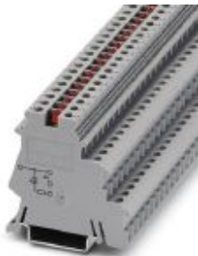
Sensor/actuator terminal block, connection method: Screw connection, cross section: 0.2 mm 2 - 4 mm 2 , AWG: 24 - 12, width: 6.2 mm, color: gray, mounting type: NS 35/7,5, NS 35/15

Please be informed that the data shown in this PDF Document is generated from our Online Catalog. Please find the complete data in the user's documentation. Our General Terms of Use for Downloads are valid ( http://phoenixcontact.com/download )