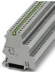
Sensor/actuator terminal block, connection method: Screw connection, cross section: 0.2 mm 2 - 4 mm 2 , AWG: 24 - 12, width: 6.2 mm, color: gray, mounting type: NS 35/7,5, NS 35/15

Please be informed that the data shown in this PDF Document is generated from our Online Catalog. Please find the complete data in the user's documentation. Our General Terms of Use for Downloads are valid ( http://phoenixcontact.com/download )