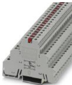
Sensor/actuator terminal block, connection method: Screw connection, cross section: 0.2 mm 2 - 4 mm 2 , AWG: 24 - 12, width: 6.2 mm, color: gray, mounting type: NS 35/7,5, NS 35/15

Please be informed that the data shown in this PDF Document is generated from our Online Catalog. Please find the complete data in the user's documentation. Our General Terms of Use for Downloads are valid ( http://phoenixcontact.com/download )