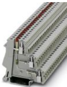
Sensor/actuator terminal block, connection method: Screw connection, cross section: 0.2 mm 2 - 4 mm 2 , AWG: 24 - 12, width: 6.2 mm, color: gray, mounting type: NS 35/7,5, NS 35/15

Please be informed that the data shown in this PDF Document is generated from our Online Catalog. Please find the complete data in the user's documentation. Our General Terms of Use for Downloads are valid ( http://phoenixcontact.com/download )