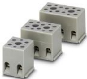
Device terminal block, for direct mounting, 12-pos.

Please be informed that the data shown in this PDF Document is generated from our Online Catalog. Please find the complete data in the user's documentation. Our General Terms of Use for Downloads are valid ( http://phoenixcontact.com/download )