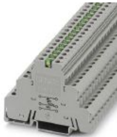
Sensor/actuator terminal block, connection method: Screw connection, cross section: 0.2 mm 2 - 4 mm 2 , AWG: 24 - 12, width: 6.2 mm, color: gray, mounting type: NS 35/7,5, NS 35/15

Please be informed that the data shown in this PDF Document is generated from our Online Catalog. Please find the complete data in the user's documentation. Our General Terms of Use for Downloads are valid ( http://phoenixcontact.com/download )